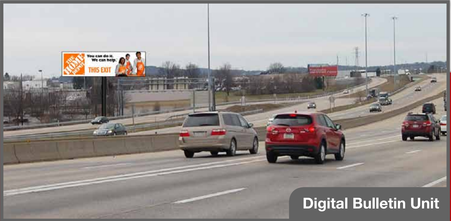
Digital Bulletin Unit